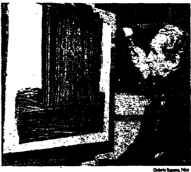
Hartung in his studio: "The ultimate contrast."

ANTIBES, France — He paints black lines. Lots of black lines. Sometimes they go in the same direction. Sometimes they go in opposing directions. Sometimes they are not black, but blue or red or yellow. Sometimes they are all those colors. It's called "lyric painting" or "action painting," because, "What matters to me is the movement." Today, at 77, Hans Hartung is generally considered the master of the school.